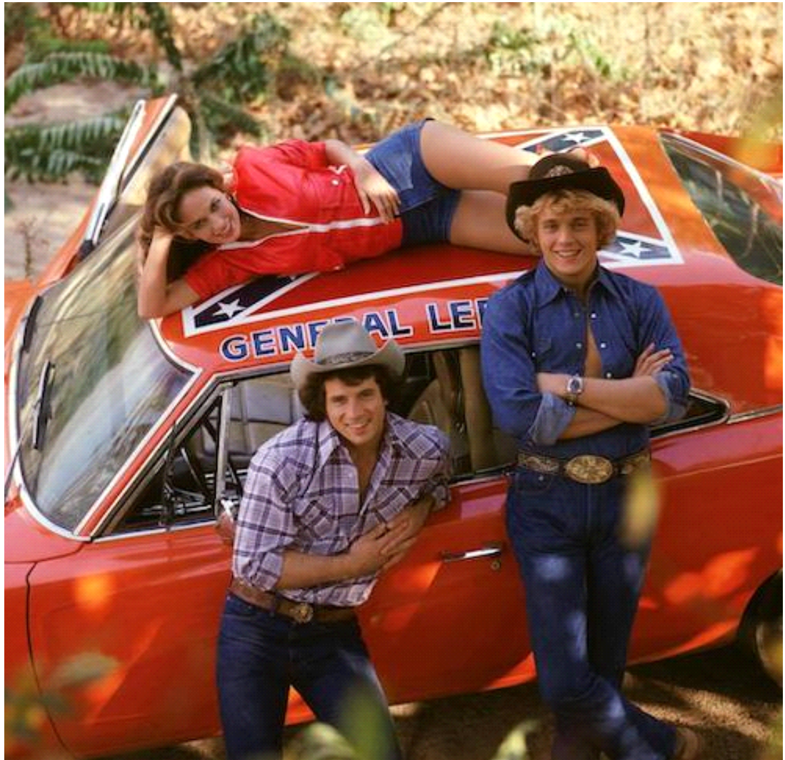
(From left to right): Catherine Bach, Tom Wopat and John Schneider starred in the iconic TV series “Dukes of Hazzard.” Wopat will be making appearances in Tennessee, Pennsylvania, and Georgia and will be joined by co-stars in Pennsylvania.